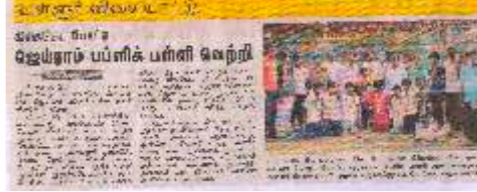
சேலம் ஜெய்ராம் பள்ளிக் பள்ளி பள்ளிக்கு ஜெஸ்ஓ 9001:2008 தரச்சான்றிதழ் வழங்கப்பட்டுள்ளது.