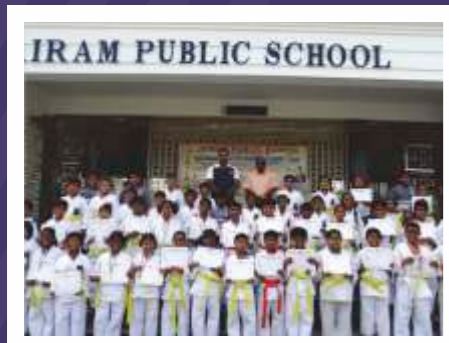
KARATE BELT EXAM