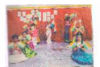
சேலம் ஜெய்ராம் பள்ளிக் பள்ளி பள்ளிக்கு ஜெஸ்ஓ 9001:2008 தரச்சான்றிதழ் வழங்கப்பட்டுள்ளது.