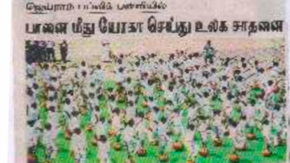
சேலம் ஜெய்ராம் பள்ளிக் பள்ளி பள்ளிக்கு ஜெஸ்ஓ 9001:2008 தரச்சான்றிதழ் வழங்கப்பட்டுள்ளது.