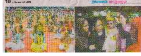
சேலம் ஜெய்ராம் பள்ளிக் பள்ளி பள்ளிக்கு ஜெஸ்ஓ 9001:2008 தரச்சான்றிதழ் வழங்கப்பட்டுள்ளது.