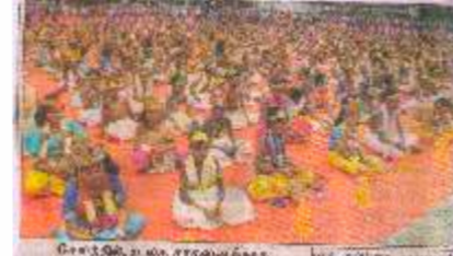
சேலம் ஜெய்ராம் பள்ளிக் பள்ளி பள்ளிக்கு ஜெஸ்ஓ 9001:2008 தரச்சான்றிதழ் வழங்கப்பட்டுள்ளது.