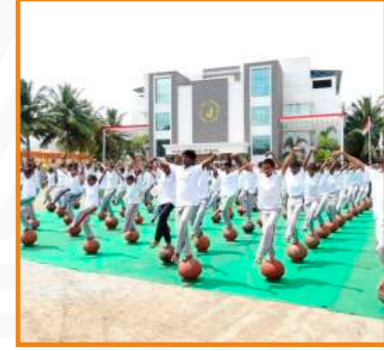
WORLD RECORD EVENT - POT YOGA