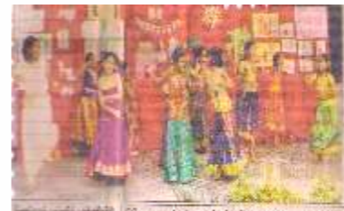
சேலம் ஜெய்ராம் பள்ளிக் பள்ளி பள்ளிக்கு ஜெஸ்ஓ 9001:2008 தரச்சான்றிதழ் வழங்கப்பட்டுள்ளது.