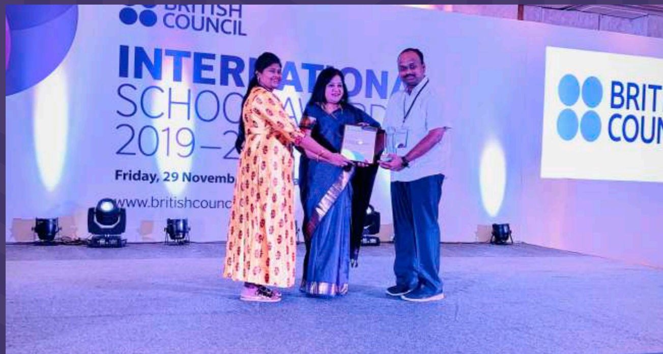
Jairam Public School is awarded with the prestigious BRITISH COUNCIL INTERNATIONAL SCHOOL AWARD