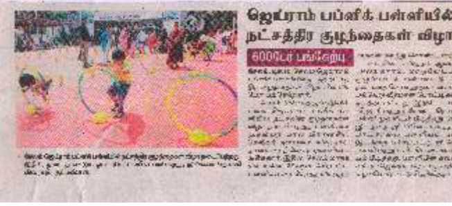
சேலம் ஜெய்ராம் பள்ளிக் பள்ளி பள்ளிக்கு ஜெஸ்ஓ 9001:2008 தரச்சான்றிதழ் வழங்கப்பட்டுள்ளது.