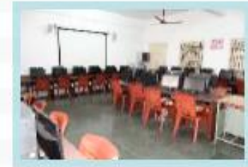
COMPUTER SCIENCE LAB