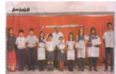
சேலம் ஜெய்ராம் பள்ளிக் பள்ளி பள்ளிக்கு ஜெஸ்ஓ 9001:2008 தரச்சான்றிதழ் வழங்கப்பட்டுள்ளது.