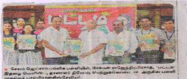
சேலம் ஜெய்ராம் பள்ளிக் பள்ளி பள்ளிக்கு ஜெஸ்ஓ 9001:2008 தரச்சான்றிதழ் வழங்கப்பட்டுள்ளது.