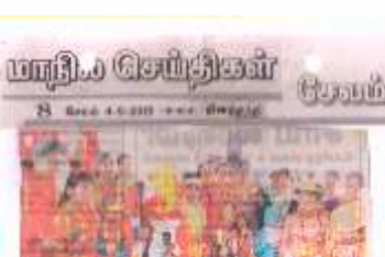
சேலம் ஜெய்ராம் பள்ளிக் பள்ளி பள்ளிக்கு ஜெஸ்ஓ 9001:2008 தரச்சான்றிதழ் வழங்கப்பட்டுள்ளது.