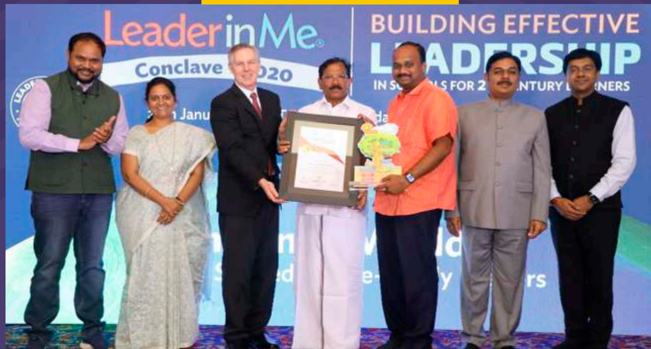
Jairam Public School is awarded with THE BEST SCHOOL OF THE YEAR AWARD by Leader in Me